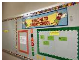
The Opening Area

PreK/K will meet in our new “Prayground” area in the old youth lounge and grades 1-4 will meet in Augsburg Alley - Grades 1-4 will begin with an opening in the large space of Augsburg Alley then break off into three smaller groups which will rotate weekly through three different areas – Creation station (art, legos, kinetic sand, crafts) Exploration Station (Science and cooking, escape rooms, etc.) and Adventure Station (games, physical activities). Creation and Exploration stations will have several stations set up where the kids can choose what activity to engage.