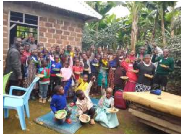
Busoka Orphans toast Saint Peter's with joy and gratitude.

The children were able to shop for needed supplies and necessities at the local village market. The photos are of a very joyous bunch of kids having lunch and sharing the joy of knowing they are loved and cared for by the Busoka Church and their friends from Saint Peter's from Lancaster, Pennsylvania. They raise their bottles of soda to their beloved aunties and uncles in Christ. Love in action! FYI - More news and updates from Busoka can be found on the Saint Peter's blog.