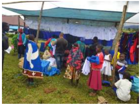
Busoka Orphans getting new school uniforms and other clothing.