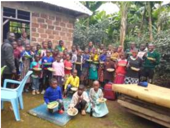
Busoka Orphans near market after buying necessities - LOVE IN ACTION.

The Tanzania Mission Committee will begin planning for our Annual Cookie Walk for the Busoka Orphans at our August meeting.