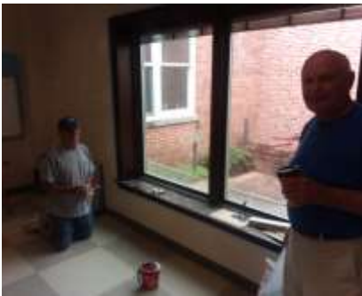
Painting Puppy and Duck Rooms