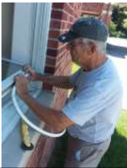
Replacing Worn Out Window Weather Stripping