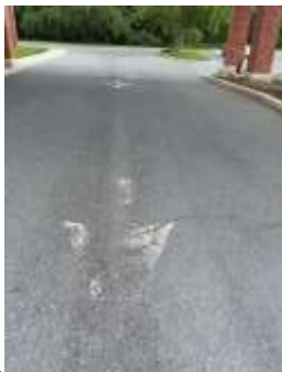
Re-painted Directional Arrows