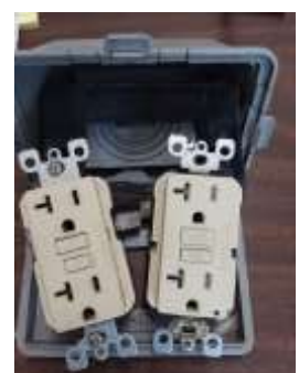
Exterior Outlet and Cover