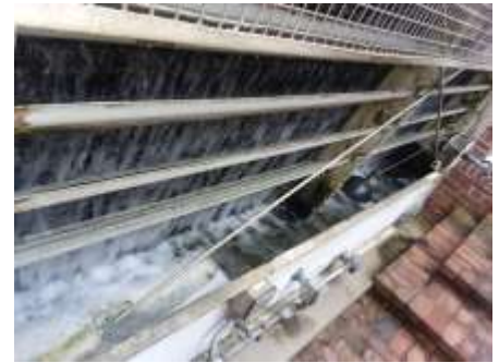
New Chemical Control Panel for Cooling Tower in Old Section