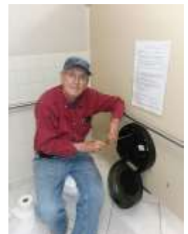
Replacing Toilet and Paper Towel Dispensers